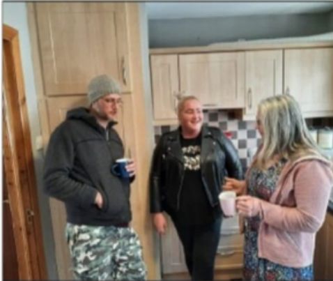
Coffee at the Sligo Traveller Support Group.

On Thursday, Sligo Glass held a coffee morning and the committee held an Autism Acceptance Charity Breakfast in