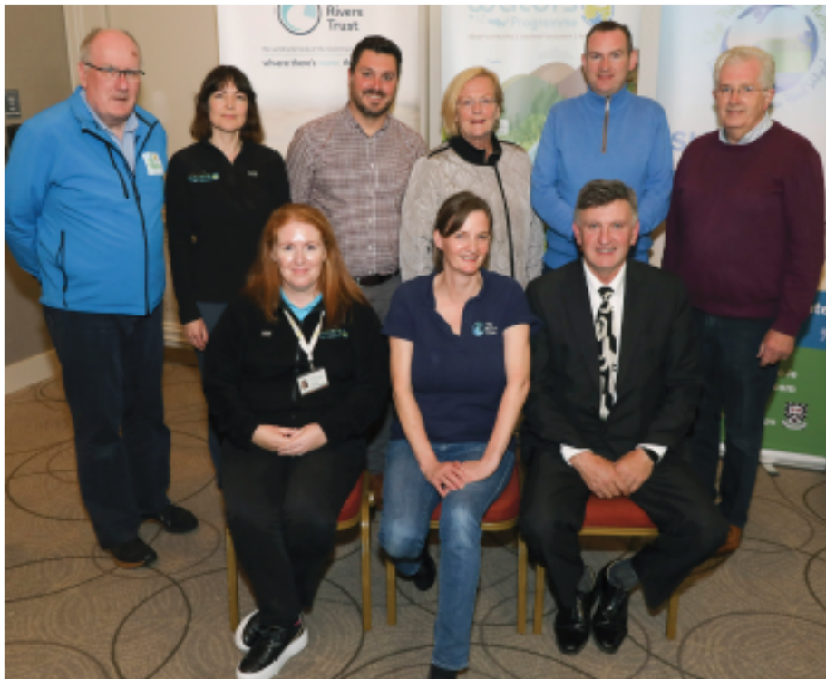
Representatives of the Rivers Trust movement at the inaugural Sligo meeting

people consider the provision of access to schools, friends, places and services via sustainable modes as the main contribution that the transport sector can make to improve their lives. The report also mentions the Sligo group came up with the slogan "Shared places and friendly faces!"