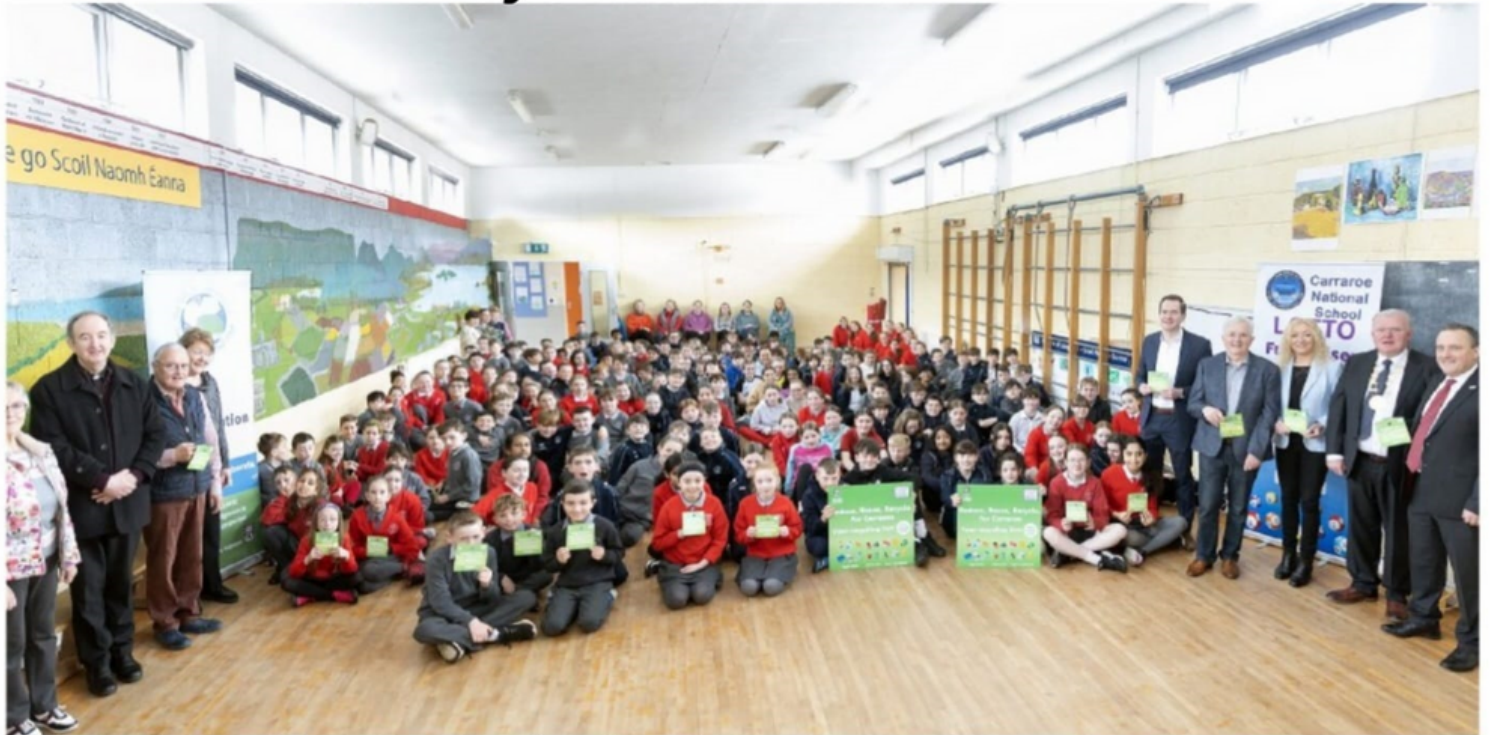
Group including pupils of Carraroe NS pictured at the launch of the recycling car sticker campaign.

Carraroe & District Regeneration Association (CADRA) has launched a new initiative aimed at raising awareness about the importance of recycling.