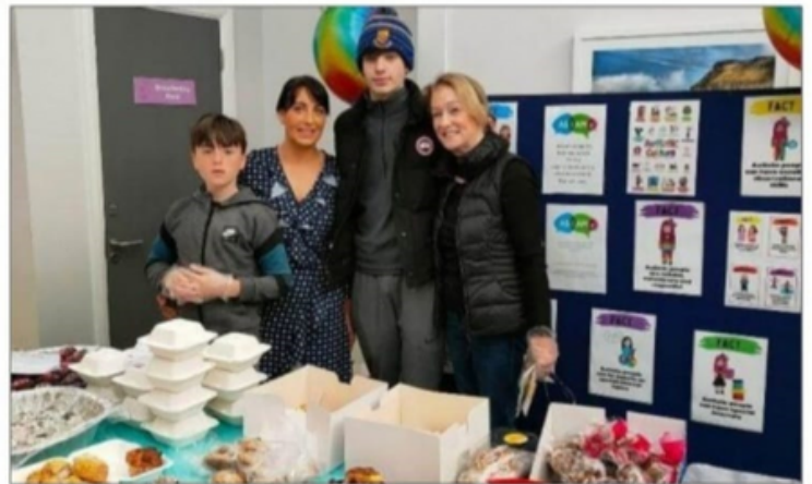
Coffee morning at Sligo University Hospital.