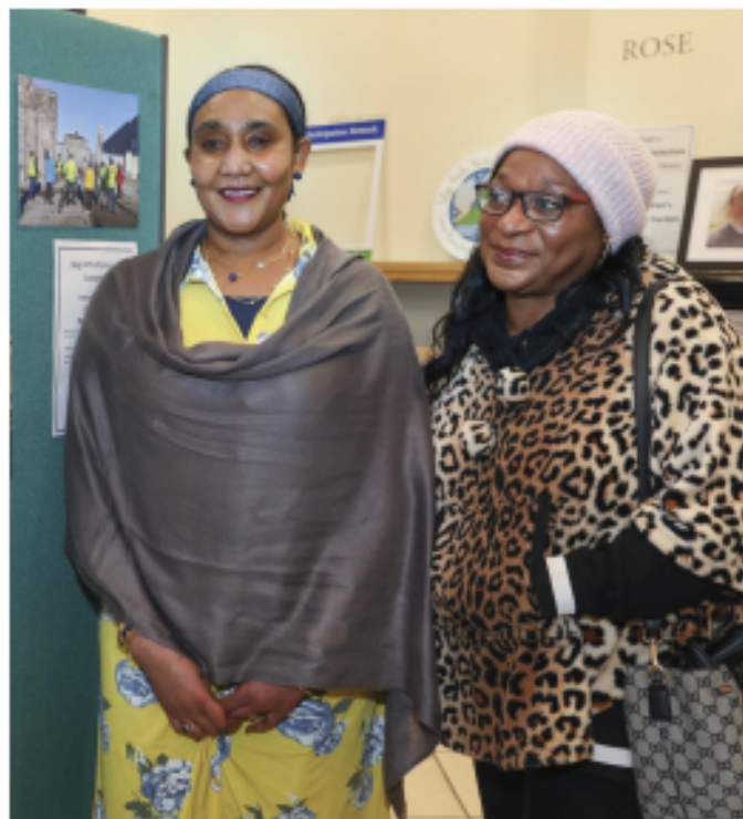
PPN members at the photography competition

Each year Sligo PPN carries out a needs analysis and the feedback received from member groups informs the development of the workplan for the subsequent year. If your group needs support email us at ppn@sligo000000.ie and let us know how we can help. To find out more about the network or to register your group go to www.sligoppn.com