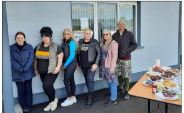
Coffee morning at the Sligo Traveller Support Group.